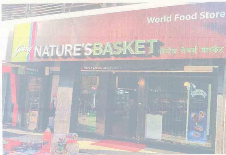
The recently inaugurated Nature's Basket store

Publication: Delhi Times Date: 28 January 2012 Edition: Delhi Page: