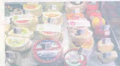
Cheese from around the world