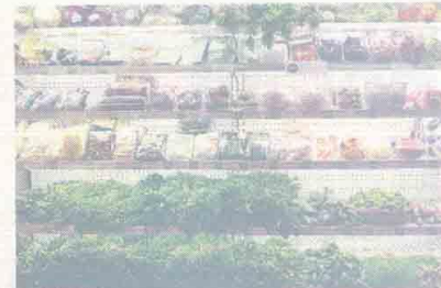
Exotic veggies for an avid foodie